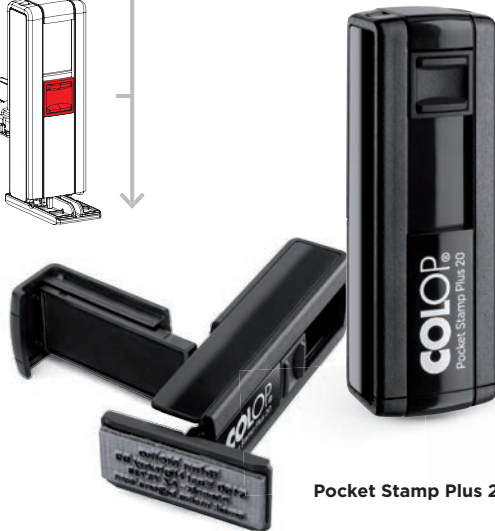
Pocket Stamp Plus 20

Pocket Stamp Plus: Open - stamp - close with just one hand