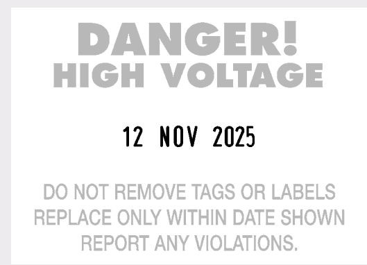
3860 / 49 x 68 mm